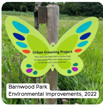
Barnwood Park Environmental Improvements, 2022