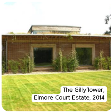
The Gillyflower, Elmore Court Estate, 2014