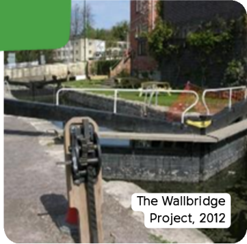
The Wallbridge Project, 2012