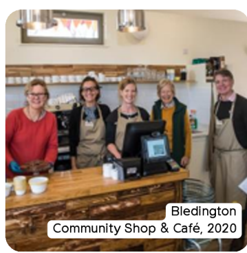
Bledington Community Shop & Café, 2020