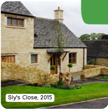
Sly's Close, 2015