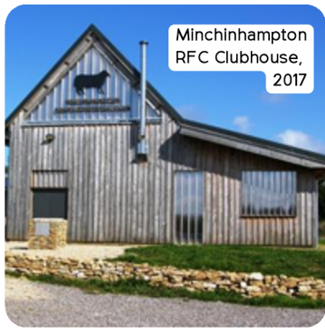
Minchinhampton RFC Clubhouse, 2017