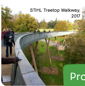
STIHL Treetop Walkway, 2017