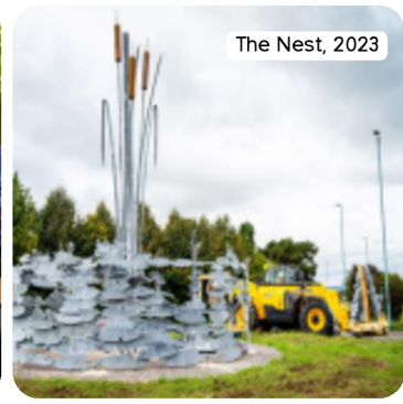
The Nest, 2023