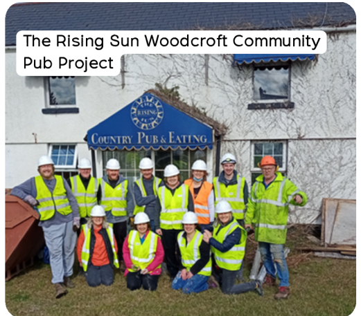
The Rising Sun Woodcroft Community Pub Project