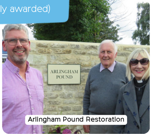
Arlingham Pound Restoration