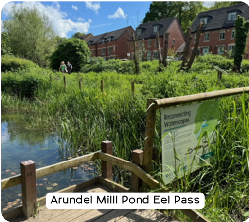
Arundel Mill Pond Eel Pass