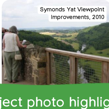
Symonds Yat Viewpoint Improvements, 2010