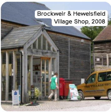
Brockweir & Hewelsfield Village Shop, 2008