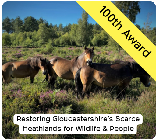
Restoring Gloucestershire's Scarce Heathlands for Wildlife & People