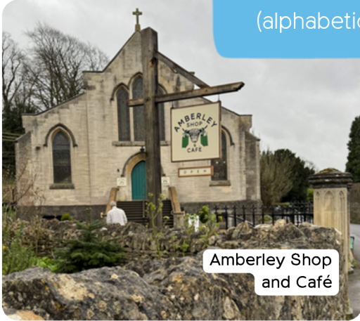
Amberley Shop and Café