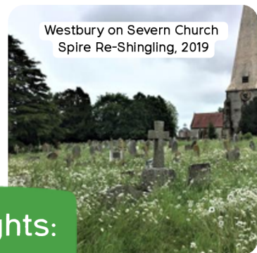
Westbury on Severn Church Spire Re-Shingling, 2019