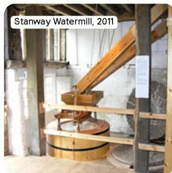
Stanway Watermill, 2011