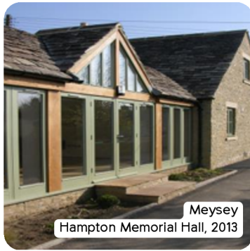
Meysey Hampton Memorial Hall, 2013