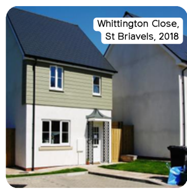
Whittington Close, St Briavels, 2018