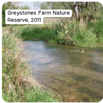
Greystones Farm Nature Reserve, 2011