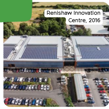
Renishaw Innovation Centre, 2016