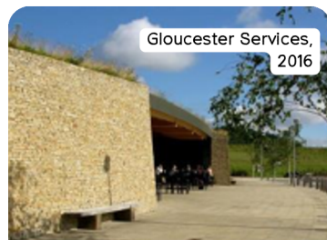
Gloucester Services, 2016