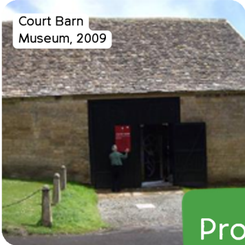
Court Barn Museum, 2009