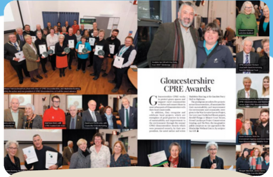
Our 2023 feature in Cotswold Life

We are especially grateful to Cotswold Life for their continued support over the years; we are thrilled that in this milestone year, as we celebrate our 100th Award, our charity will once again be highlighted in their publication.