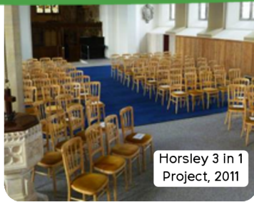
Horsley 3 in 1 Project, 2011