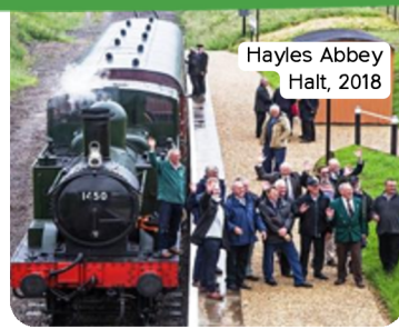
Hayles Abbey Halt, 2018