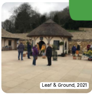
Leaf & Ground, 2021